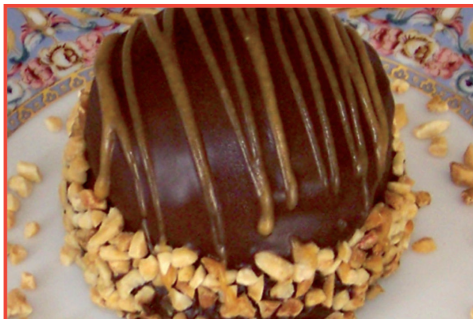
Peanut Butter. . . . $8.05