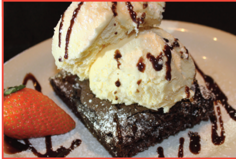
Monster Brownie. . $8.05