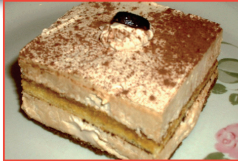
Tiramisu. . . . . $8.05