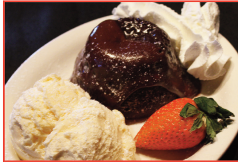
Chocolate Lava . . . $8.05