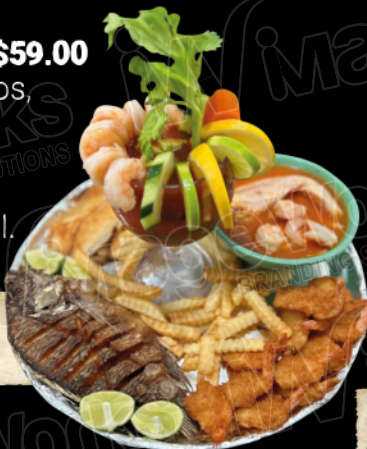
DEL MAR Pack

2 Dz camarones rancheros, 2 Dz fried shrimp, 1 whole tilapia, 2 fish filet, small 7 mares and small shrimp cocktail.