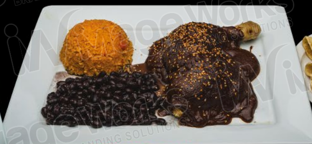
POLLO EN Mole