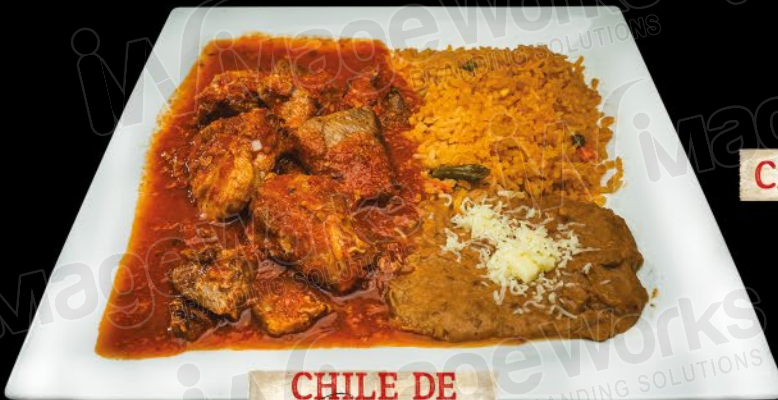
CHILE DE Puerco