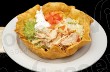
AVOCADO CHICKEN Salad